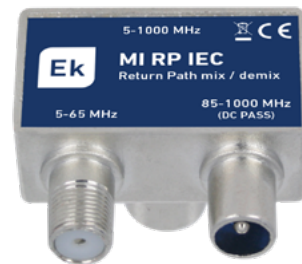
MI RP IEC