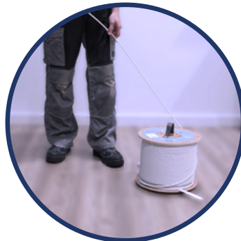
EK ROLLER COIL UNWINDING